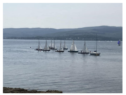
Loch Long start to the 1st race of the regatta

More Mischief led the Flying Fifteens home for class honours, as did Tom Piper for the Piper fleet, with Sula taking line honours for the Loch Longs with 1st place with Dolphin and Capricorn taking 2nd and 3rd. Marisca won the coastal race over Positivity, but the Positivity crew made up for it in securing a number of raffle prizes. Our cadets also participated in the sailing competition holding their own mini regatta closer to shore while the adult boats strayed further afield. Light winds and warm breezes helped make their day.