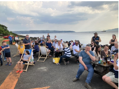
A full patio enjoying the prizegiving