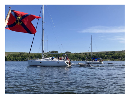
Picnic flotilla heading off

The Annual picnic began the month of activities and a glorious day was provided to travel in convoy to Ardentinny beach where water sports, beach games, BBQs and banter were held all afternoon. The sun stayed out, the wind kept the midges off and a lovely day was had by all.