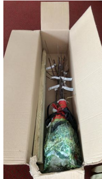
Apple treelings for planting at CSC

So if you are a gardener, or not and want to participate in that, let us know. You do not need to be a club member. We see this as a contribution to the community and available to anyone.