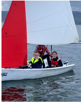
Learning the basics