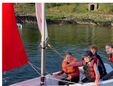
Off we go!