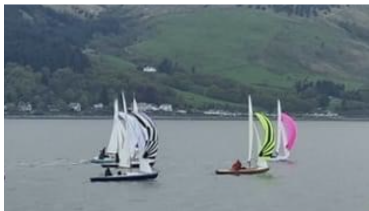
Spinnaker run to the Cove mark before the final leg to the finish. Sula and Tarka vying for the lead

On the social side, Sunday Scrans are going very well and thanks to our sponsors, The National Community Lottery, different activities have been enabled at each Scran. In May, the Sunday Slime Scran was a sell out success, over 60 people came, many who had never been to the club before. In addition to the monthly lunch, the Slime Workshops were a great success and many other activities for the younger generation kept everyone busy and happy. The lovely weather was a great bonus. Champion of