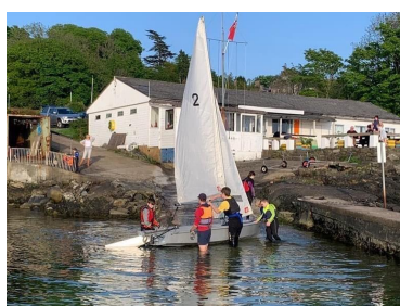
Cadets rigging up

And heralding a new generation of sailors at Cove, the Cadets have started their season with a full contingent of eager youngsters keen to get wet and learn some skills. A few evenings and Saturdays of light winds have helped to get them on and in the water.