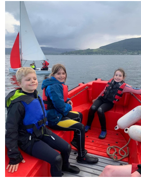
The next generation raring to go!

And so to the Loch Long fleet. Heralding their 86 th year since No.1 first floated out on the loch, the first few races have seen strong competition among the 7 boats currently afloat. A variety of wind directions have aided the bridge team in setting out challenging courses for the Tuesday and Friday night races. The Big Regatta, generously sponsored by RB Marine of Rosneath will be held on 10 June. Racing will start at 11:30. Food and fun, games and music will be in attendance. We hope you will be too. More details soon on the social media.