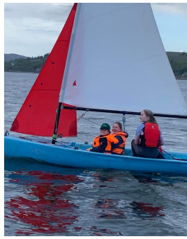
Cadets teaching cadets