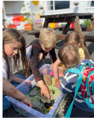
Sand play with foraged rocks and things

Dates of future Sunday Scrans can be found on our website.