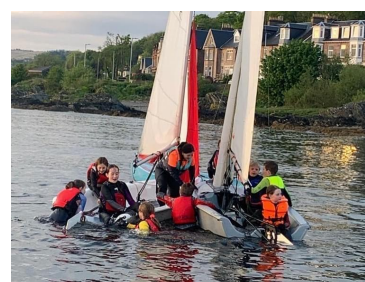
Rafting up for some water fun