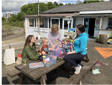
Water fun on the patio