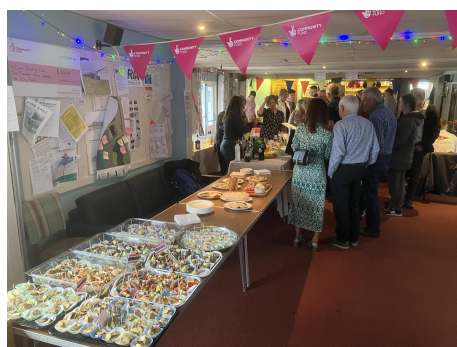
Canapes and cocktails ready to roll