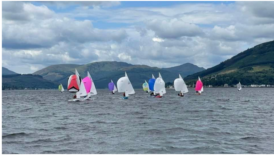
Spinnakers flying on Tuesday

Enjoying the ceildh in the Cove Burgh Hall that evening was a welcome treat for all participants with a hall long Orcadian Strip the Willow ending the nights activities as the rain finally settled in.