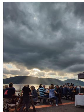
The end of day 1

Monday dawned with a lighter wind coming out of the Northwest and the round the cans race to Blairmore kicked off the days events. Close sailing, many changes of position and the luck of the wind saw the fleet lead change several times. A welcome lunch break ashore and an afternoon race completed Day 2.