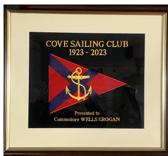
The presentation burgee