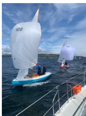
Tik Hai and Pied Piper