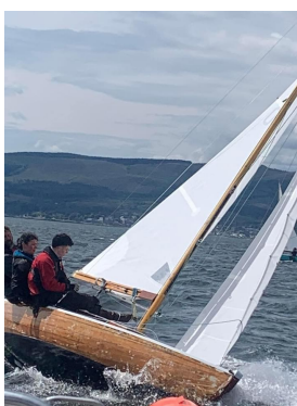
Grey Goose heeling past