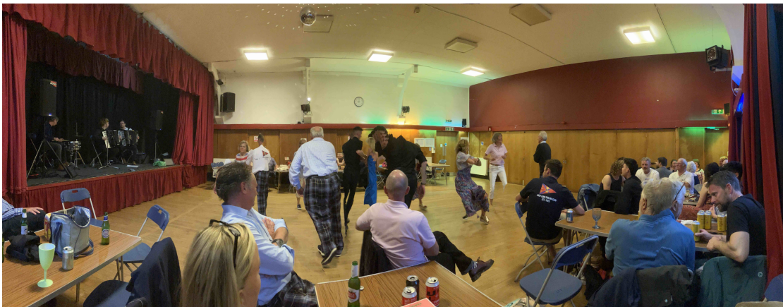
Dancing the night away

Enjoying the ceildh in the Cove Burgh Hall that evening was a welcome treat for all participants with a hall long Orcadian Strip the Willow ending the nights activities as the rain finally settled in.