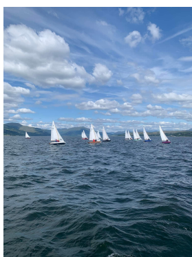
Heading off from the start